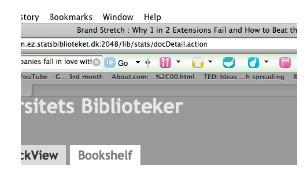
Fig. 2. Extensions vs. new brand (Taylor and Nichols 2003)

As seen in the figure above only 2% of the new brand launched on the market are completely new creations and this shows again that it is very difficult and expensive for a company to come up with a new brand name for a new product (Kotler 2006, 298). Hence, a brand extension gives companies an opportunity to put a new product in the market in a more inexpensive way. But even if the cost issue could somehow be solved with the use of this strategy, far from all brand extensions are successful. Figures from 1997 show that 28 % of the line extensions failed and the corresponding figure for category extensions were at 84 %. (Völckner and Sattler 2002, in Uggla 2002). Peter (1996) is even more pessimistic stating that only about 1 in 100 of the launched products will make it in the market.